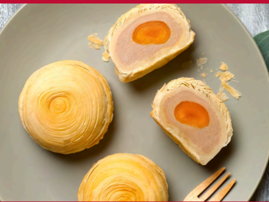
Teochew Yam Paste with Single Yolk