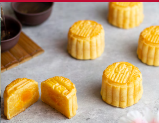
Mini Baked Egg Custard with Yolk