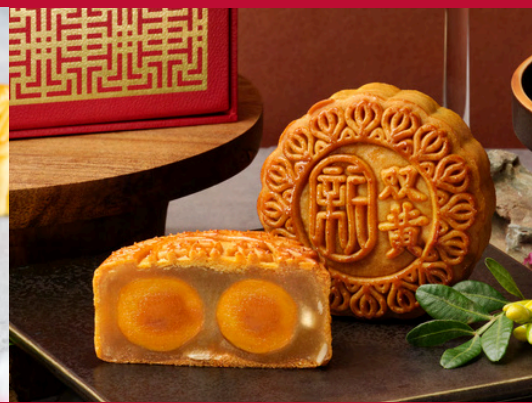
Low Sugar White Lotus Seed Paste with Double Yolk